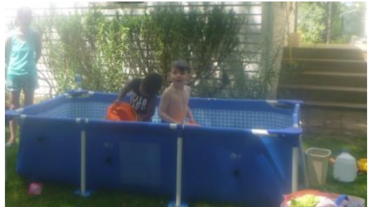
A bit of Kayak Time and Swimming