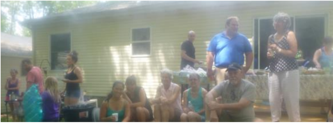
The Deck Group